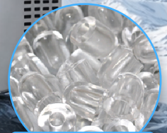
Bullet Ice 22mmØX40mm

The SN-25C is a compact, high-hardness ice maker that produces bullet, built with a durable AISI304 stainless-steel exterior and an easy-to-reach ON/OFF switch. It features a specialised built-in spray-type evaporator to improve ice clarity and hardness, an air-cooled system, and R290 eco-friendly refrigerant. Designed for hygiene and reliability, it